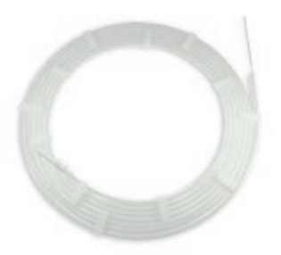
Dispenser guide wires

The wire can be easily ejected and retracted by means of this innovative dispenser. Owing to its compact design, the dispenser is handy and easy to operate. Rinsing the wire is also easy and fast when using the dispenser.