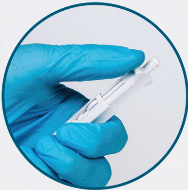
Single hand extension

EndoTNeedle was engineered to balance performance and value while delivering a highly reliable needle for your most tortuous cases. Designed with quality materials, features from premium needles, and a handle your staff will love. The EndoTNeedle is your new everyday needle.