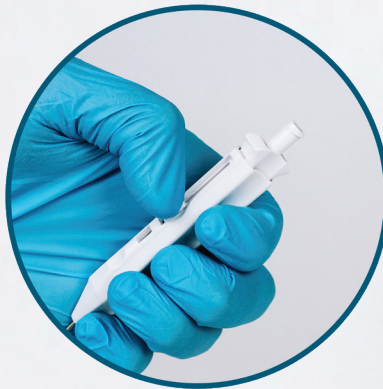
Click to retract